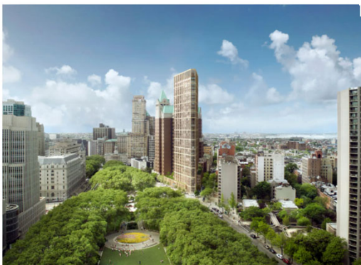
Rendering of plan for 280 Cadman Plaza West in Brooklyn, including an expanded public library. Marvel Architects, Rendering by Kilograph