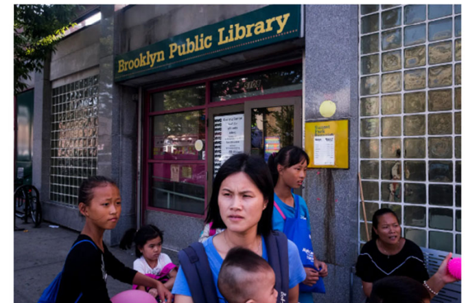
The Sunset Park Library in Brooklyn at closing time on Saturday.