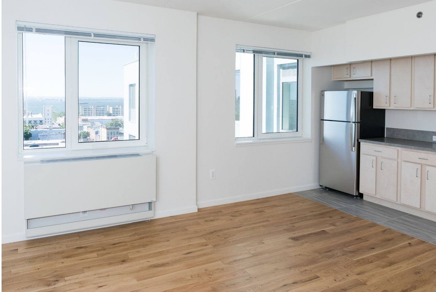
Interior of a residential apartment with views of New York Harbor