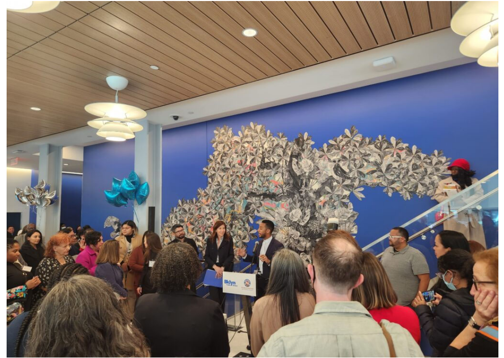
The November 2023 ribbon-cutting