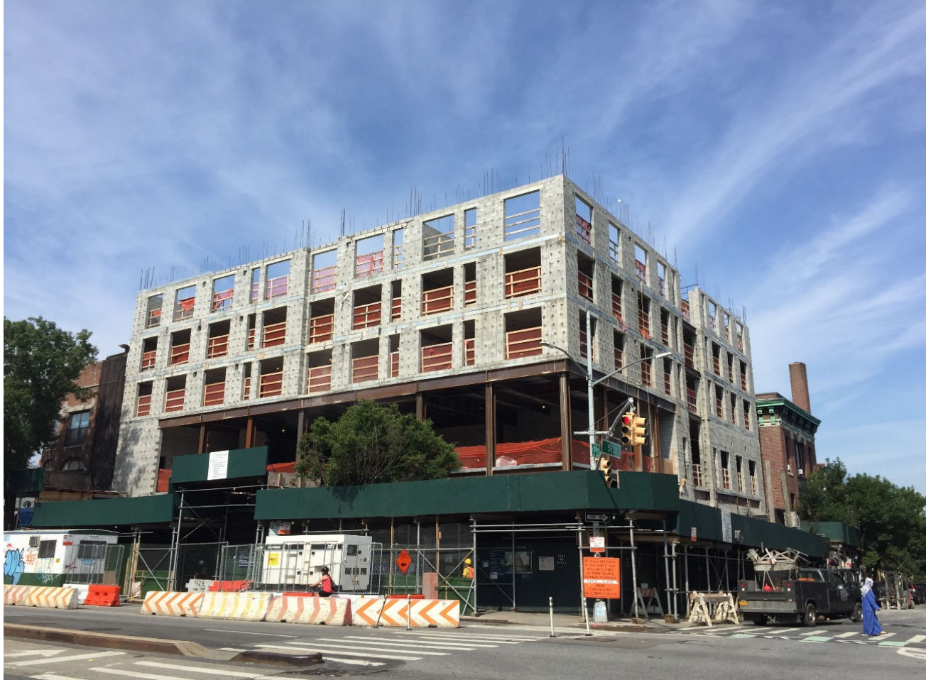
The building under construction.