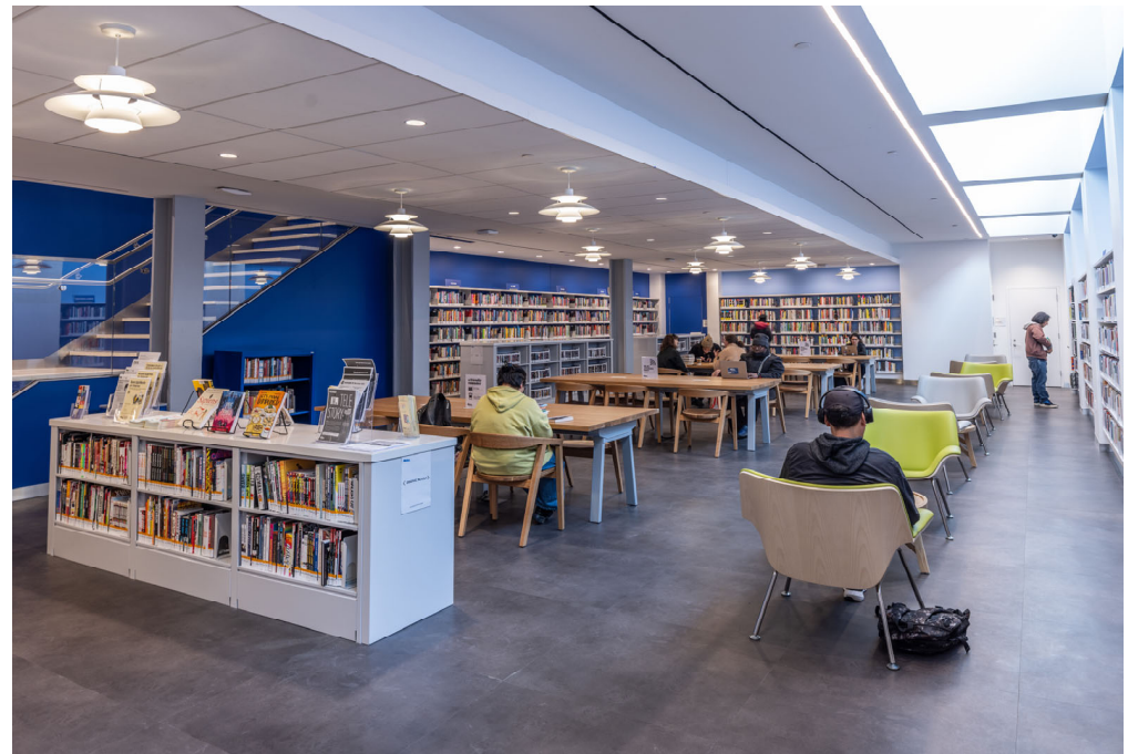
The library space.