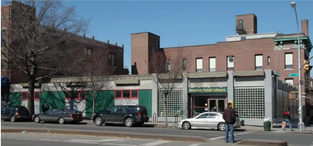
The former Sunset Park branch of the Brooklyn Public Library prior to redevelopment.