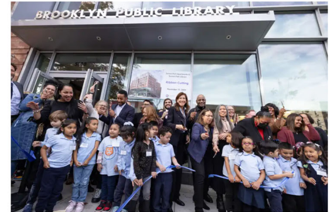
Students from nearby P.S. 001 helped officials cut the ribbon at the new Sunset Park Library.