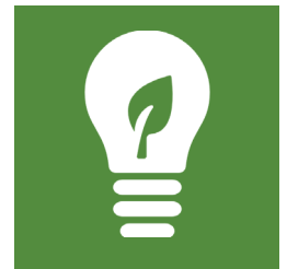
Installing energy efficient lighting