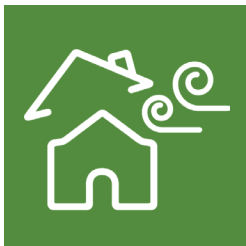
Sealing air leaks