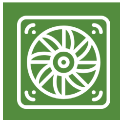
Installing ventilation fans