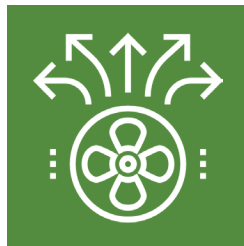
Repairing drafty duct systems