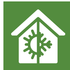
Repairing or replacing heating & cooling systems